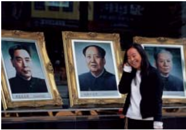
What would Mao think?

contextual in all things, never absolute or final. A bit didactic, incurably pragmatic, secretly romantic. Thirty-some women have teddy bears, 30-some men think they are too old to play sports. Everyone in every city in China is addicted to karaoke, ridiculously adept at card games. Note: Do not ever play cards for