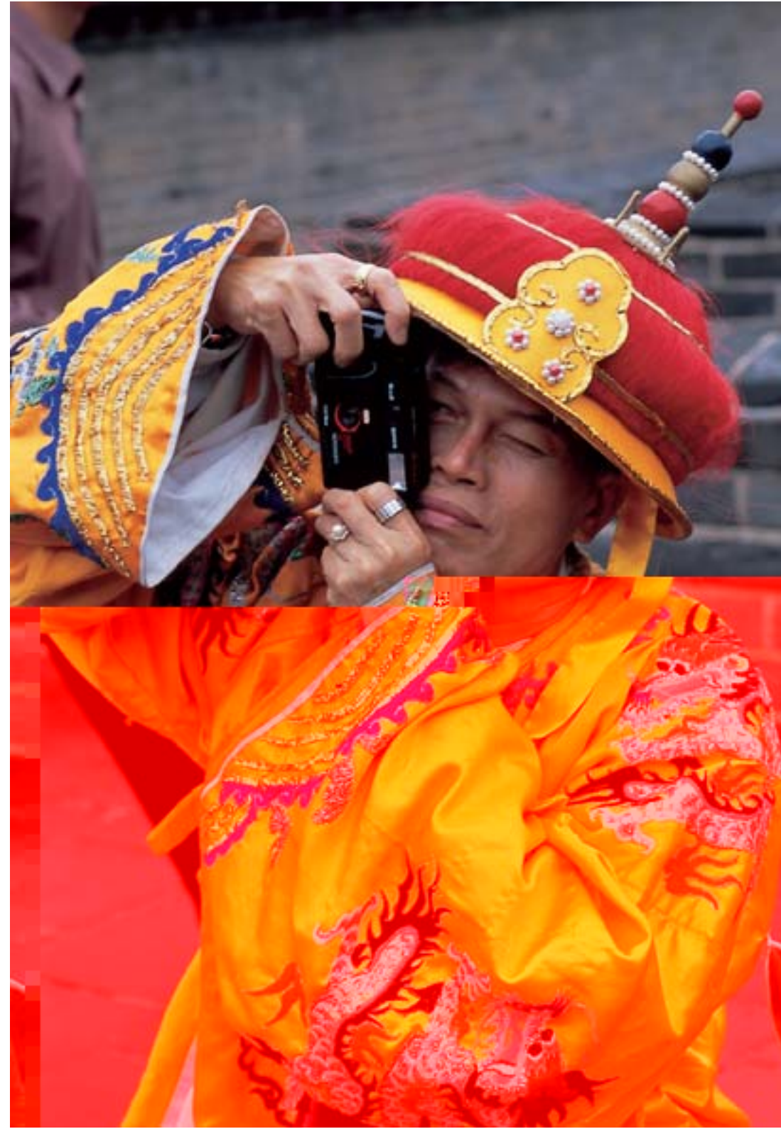
Photographer in Imperial Court attire.